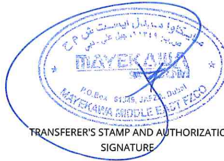
TRANSFERER'S STAMP AND AUTHORIZATION SIGNATURE

I / WE NASH ENGINEERING FZCO CERTIFY THAT AS