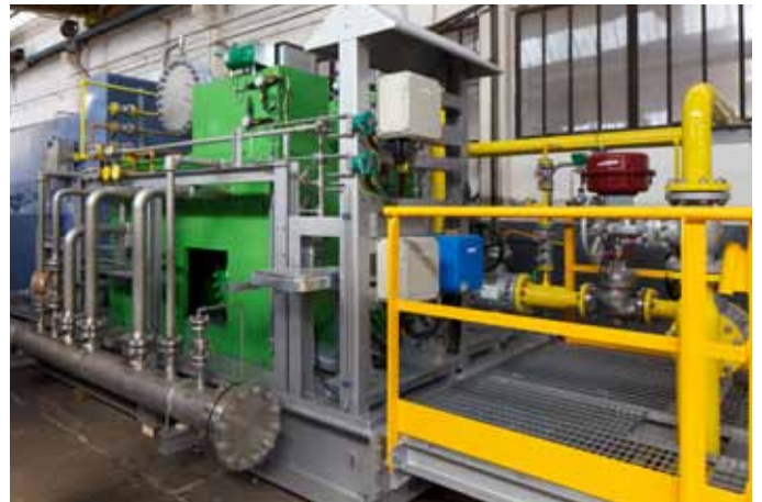
CEPSA San Roque Spain GH 320 package for ISOMAX Unit installed in CEPSA Refinery San.

Seaworthy packing according to UNI or Clients standards Barrier bags and shipping & lifting drawings