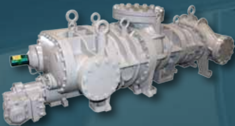
COMPOUND COMPRESSOR (UD & SCV SERIES)