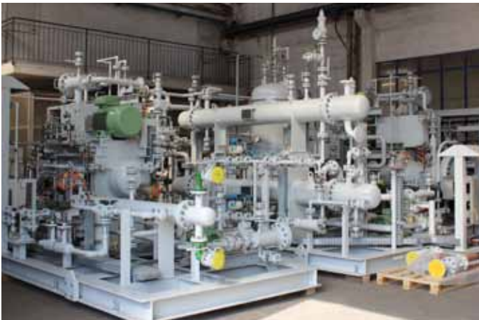
Maire TECNIMONT No. 3 Packages for Etileno XXI project in Mexico Total of no. 5 compressor units.