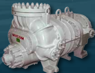
SINGLE STAGE COMPRESSOR (UD & SCV SERIES)